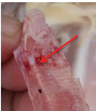
Figure 2: Trachea of pullets fed control diet (left) and diet containing Xtract Nature (right).

Stressful events may occur during this critical 18 week phase. The intense vaccination program is one example. In this context, a standardized phyto-molecule additive (Xtract Nature) has demonstrated an ability to modulate the animal's immune system. It enables the pullet to better cope with vaccination, such